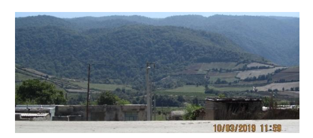
Figure 1. Land use changes in natural resources in Golestan province, north of Iran. Changing forests and hills to farm lands and emerging new rural areas and human settlements in these regions during three decades ago (by author. October 3, 2019).