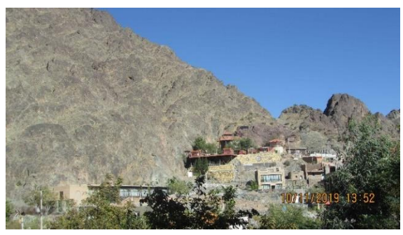
Figure 8. Destructing domain of Bagheran mountains range for establishing touristy restaurant and hotel in Birjand, south Khorasan province, east of Iran. This established in beginning without law permissions of

responsible organizations but after 2 years later, owner got its law permissions from responsible organizations by various ways (By author. October 11, 2019).