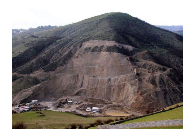
Figure 5. Destructing a mountain with its covering forest for exploiting mine in Golestan province, north of Iran (Summer 2018).

The rural livelihood was directly dependent on rangeland and agricultural land, which effectively affected conservation operations. Based on th sustainable development scenario, productive and fertile lands with high potential for farmland activities must be protected against excessive encroachment of urban structures. In a temporal and gradual process should be undertaken to first decrease historical growth rates and then shift urbanization pressure to potential locations. Both composition and configuration of urban growth require attention to ensure efficiency of a corresponding policy (Moein et al., 2018).