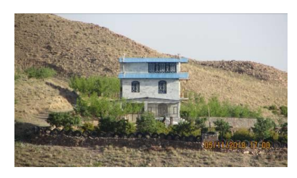
Figure 6. Changing domain of mountains and natural hills to gardens and second houses for vacations of rich and powerful urban people in south Khorasan province in east of Iran. This unfavorable phenomenon occurred without law permissions of responsible organizations but gradually after 2-5 years later, rich and powerful urban people achieving their law permissions from responsible organizations by various ways (By author. 2018).

natural attractions and sub-watersheds mountainous status, holly shrines, ancient cemetery and verdurous grasslands tourism development must be proposed and considered (Figure 6, 7 and 8).