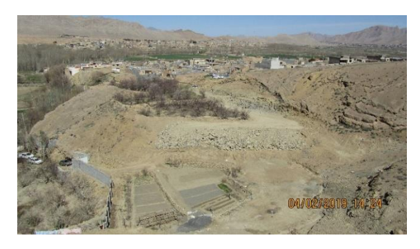
Figure 4. Changing natural hills and domain of mountains to gardens and second houses for vacations of rich and powerful urban people in west of Isfahan city and beside Zayandeh rood river in center of Iran. This unfavorable phenomenon occurred without law permissions of responsible organizations but gradually after 2-5 years later, rich and powerful urban people achieving their law permissions from responsible organizations by various ways (By author. April 2, 2019).

Changing natural hills and domain of mountains to gardens and second houses for vacations of rich and powerful urban people in west of Isfahan city and beside Zayandeh rood river in center of Iran. This unfavorable phenomenon occurred without law permissions of responsible organizations but gradually after 2-5 years later, rich and powerful urban people achieving their law permissions from responsible organizations by various ways (Figure 4). And destructing a mountain with its covering forest for exploiting mine in Golestan province, north of Iran (Figure 5).