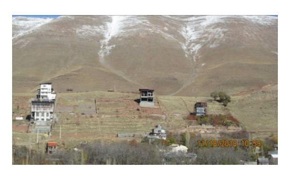
Figure 7. Destructing domain of mountains and natural hills for establishing gardens and second houses for vacations of rich and powerful urban people in Damavand city, Tehran province, capital of Iran. This unfavorable phenomenon occurred without law permissions of responsible organizations but gradually after 2-5 years later, rich and powerful urban people achieving their law permissions from responsible organizations by various ways (By author. November 18, 2018).