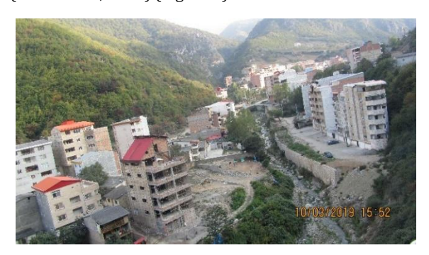
Figure 2. Changing forests, mountains and hills because of growth in urbanization and demand of urban people in Zyarat village in Golestan province, north of Iran. This region was a nomadic zone solely until three decades ago, but nowaday it has shifted to one of the most expensive places for vaccations of rich and powerful urban people for establishing their second houses that often utilizing by them less than one month in a year. This unfavorable phenomenon also caused destruction forest, demolition hills plus increasing soil erosion and emerging floods in this unique region (By author. October 3, 2019).

recreational attractions in areas with lower levels of competition, the pressure of future population growth can be shifted to areas with higher suitability for urbanization and lower competitions with farmlands (Moein et al., 2018) (Figure 2).