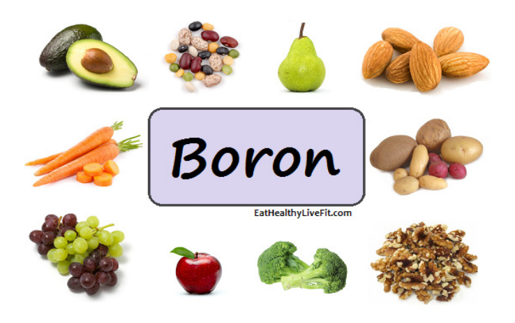
Figure 3. Sources of Boron (27).

The important sources of boron are vegetables, fruits (such as avocado, apricot and raisin), nuts (such as hazelnut, walnut and almond) and legumes (21). It was observed that boron supplementation is an important support in treatment of Lupus Erythematosis, Candida Albicans, parasites, alergies, irregular sex hormones, menopause symptoms, aging, osteoporosis an arthritis (25, 26). Boron supplementation has anti-inflammatory, anticancer, antiviral, antibacterial and antifungal properties (29).