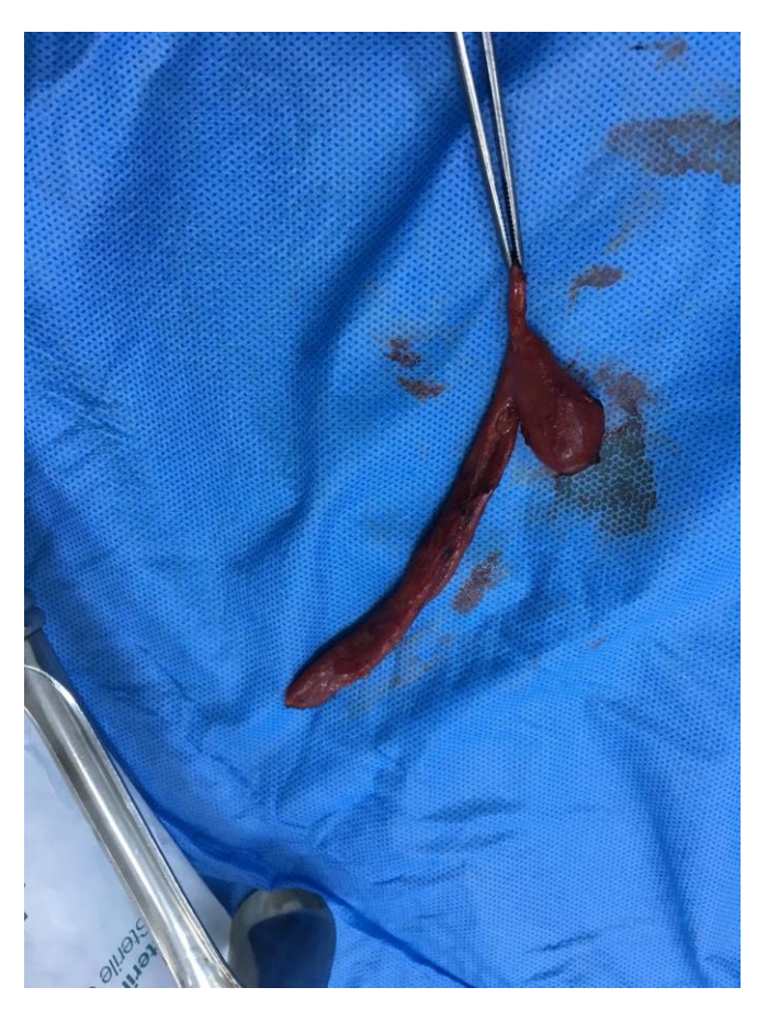
Figure 2: Intraoperative imaging of gallbladder duplication in Case 1