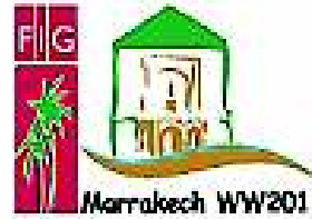
FIG Working Week and General Assembly. www.fig.net