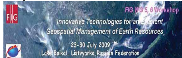
FIG Commission 5 and 6 and SSGA Workshop on "Innovative Technologies for an Efficient Geospatial Management of Earth Resources". Organised for the first time in Russia by FIG and Siberian State Academy of Geodesy (SSGA). http://www.s-tur.com/geol

23-30 Temmuz, Listvyanka, Lake Baikal, Rusya Federasyonu