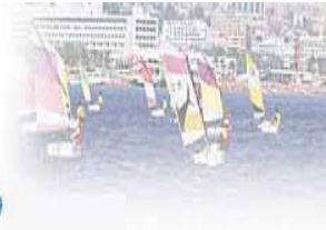
FIG Working Week and XXXII General Assembly - New Horizons across the Red Sea - Surveyors Key Role in Accelerated Development www.fig.net/fig2009

Dan Eilat Hotel, Eilat, Israel, 3-8 May, 2009