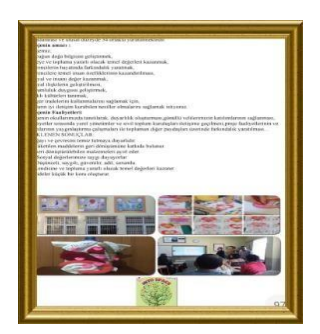
Figure 1. Activity Examples

Activities related to our values of patriotismi solidarity, love, respect, tolerance, compassion, responsibility, health environmental, protection, cleanliness were held and the importance of protecting our nature and environment with our cultural heritage values was emphasized. The social media institutions of the project were created, preliminary surveys were made in the forum section, the opinion of the partners and students were taken and the business process was provided. School, province, country and student preentations of the project partners were made. Mixed country teams were formed and the students working in these teams were allowed to conduct joint research on our values in cooperation. The process was evaluated with online activities. In cooperation with TEMA, citrus seeds were planted, saplings were grown, and activities were carried out to protect our national, moral and cultural values with environment and nature-friendly activities. The projet is integrated into all courses with different disciplines.