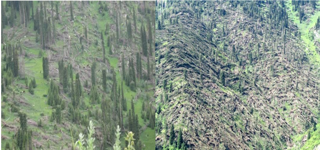
Image 1. View of the windthrow area in Gorelnik in 2012, Medeu, Almaty