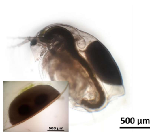
Figure 2. Adult Daphnia magna in the medium-dose group of KCl bearing melanized eggs known as Ephippium. A closer microscopic photograph of the ephippium with two eggs on the left side.