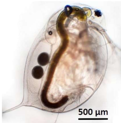
Figure 1. Adult Daphnia magna of control group. The spherical heart is located on the dorsum of animal and in front of the brood chamber where the eggs are carried. There are two eggs in the brood chamber.