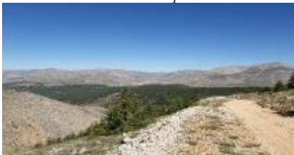
Forested area and rocky habitat