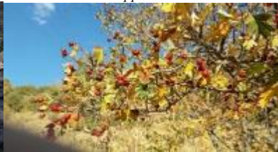
Crataegus monogyna subsp. monogyna