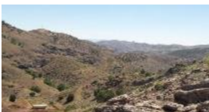
Damaged foresty, steppe and Rocky habitat