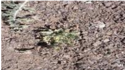
Cnicus benedictus var. benedictus