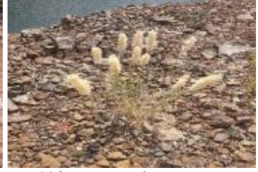
Melica persica subsp. persica