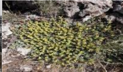
Scutellaria orientalis subsp. orientalis