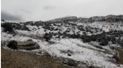
Forest, open area habitat