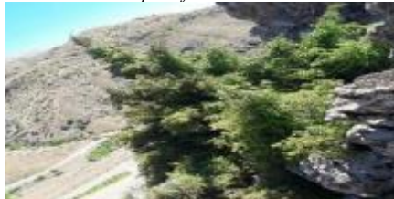
Juniperus oxycedrus subsp. oxycedrus