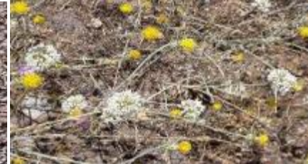
Centaurea solstitialis subsp. solstitialis