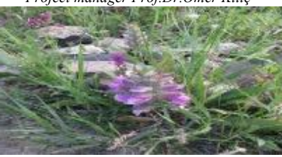
Acanthus dioscoridis var. dioscoridis