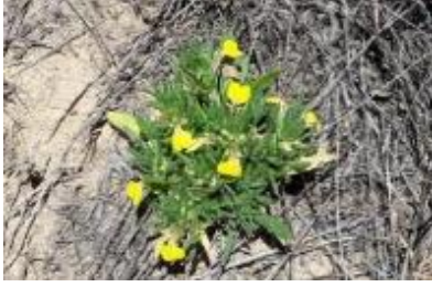
Ajuga chamaepitys subsp. chia var. chia