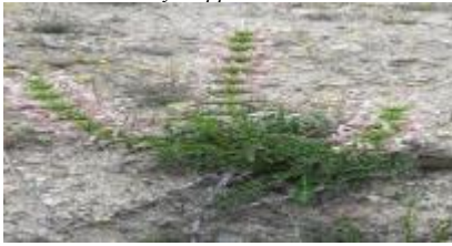
Morina persica subsp. decussatifolia