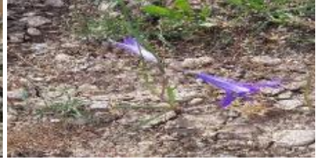
Ixilorton tataricum subsp. montanum