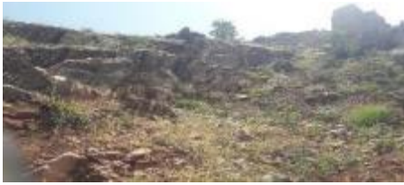
Stony steppe habitat