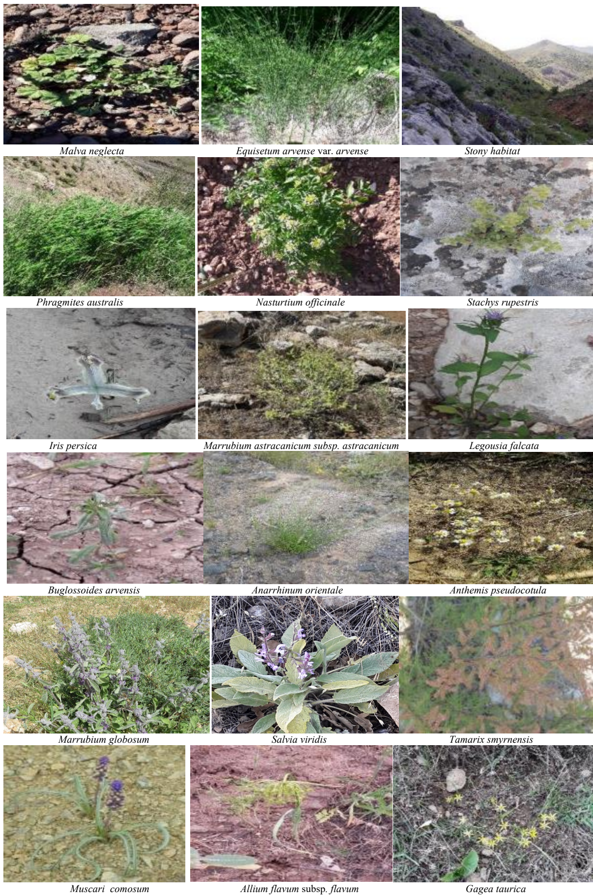
Figure SI-1: Some plant taxa and habitats in the research area