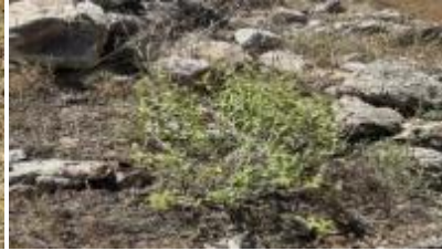
Marrubium astracanicum subsp. astracanicum