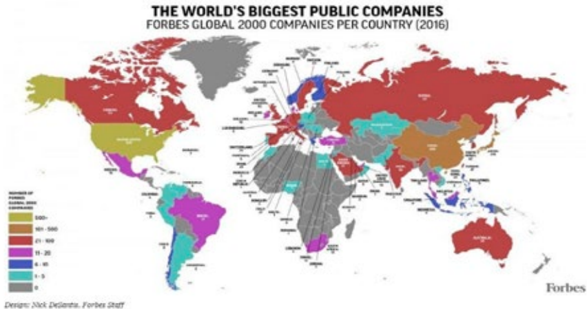
Map1: World's Biggest 2000 Companies 2016

In addition while looking at the number of the world's biggest public companies, China's position after USA and the Russia & India's positions after the European competitors can be seen from the map below.