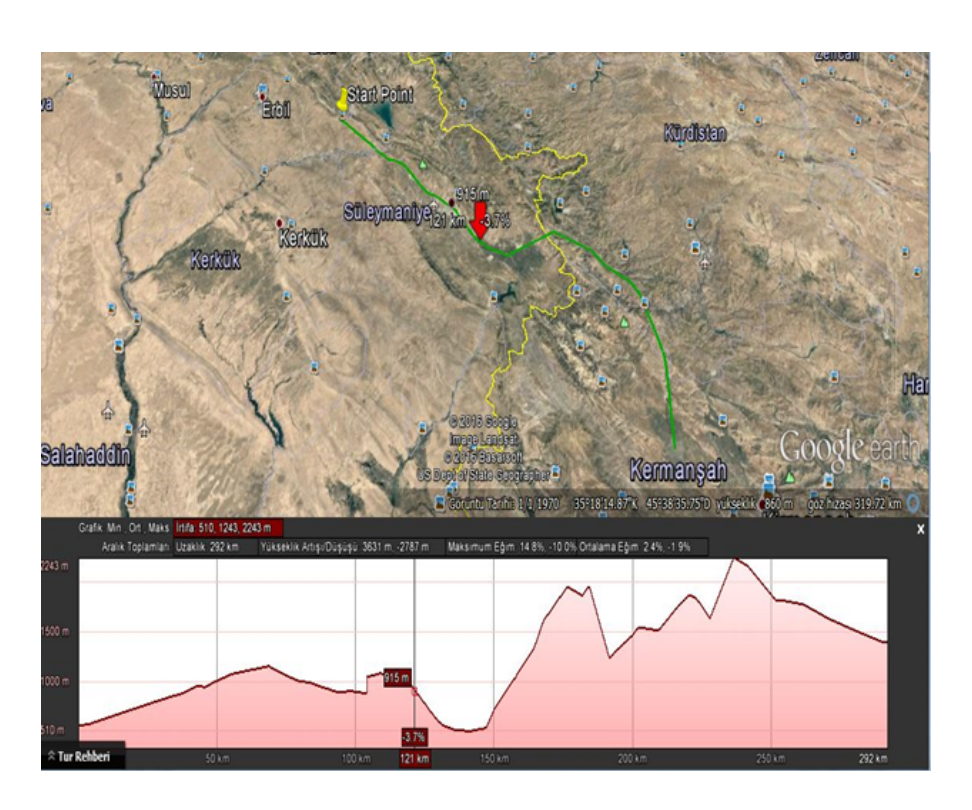
Map 4: Northern Iraq to Iran Pipeline.