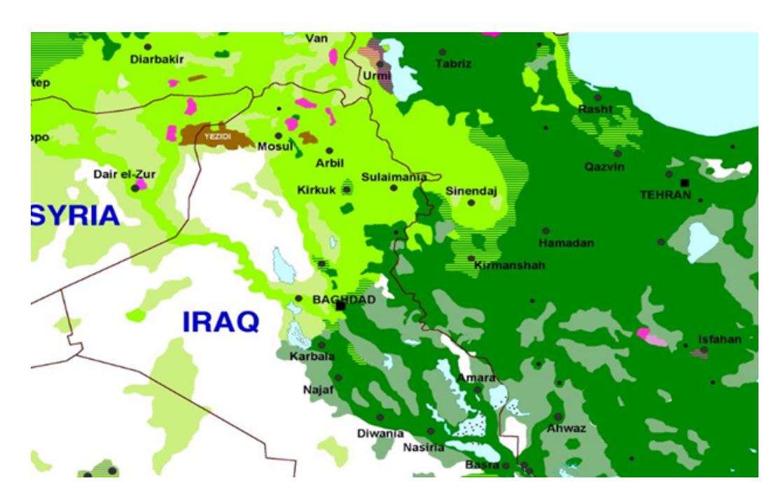
Map 2: Religion Distribution of the Region. Dark green refers to Shia, light green to Sunni and pink to Christian societies.

"Kurdish nationalism as if an independent Kurdish government founded in Northern Iraq, both Turkey and Iran (naturally Central Iraq Government) will never agree on allowing such attempts."