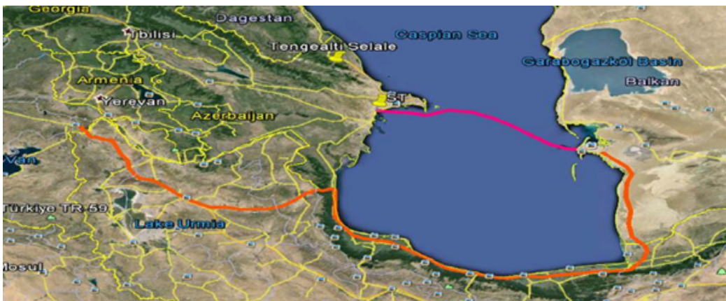
Map 2: Trans Caspian & Trans Iran Pipelines from Turkmenistan. 3

As seen from the Table 8 above, this option is the only economic option that can be successful.