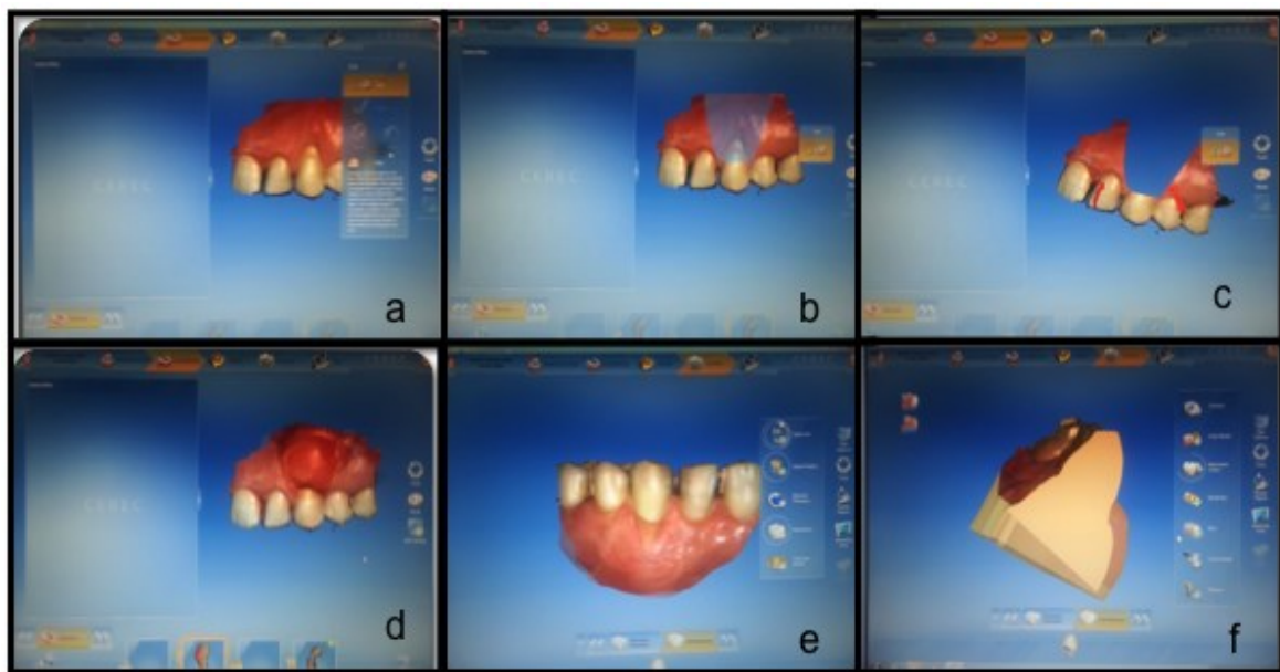
Figure 1: a. Pre-operative 3D image (from CAD-CAM) b. Cutting the operation field from the image field (from CAD-CAM) c. Cut operation field (from CAD-CAM) d. Rescanning operation area at post-operative 1 st month (from CAD-CAM) e. Superimposition of images at post-operative 1 st month (from CAD-CAM) f. Superimposition of images at post-operative 6 th month (from CAD-CAM)