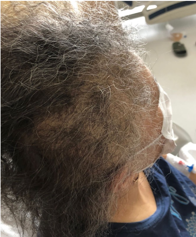
Fig. 2. The inspection for the first day of sudden hairloss