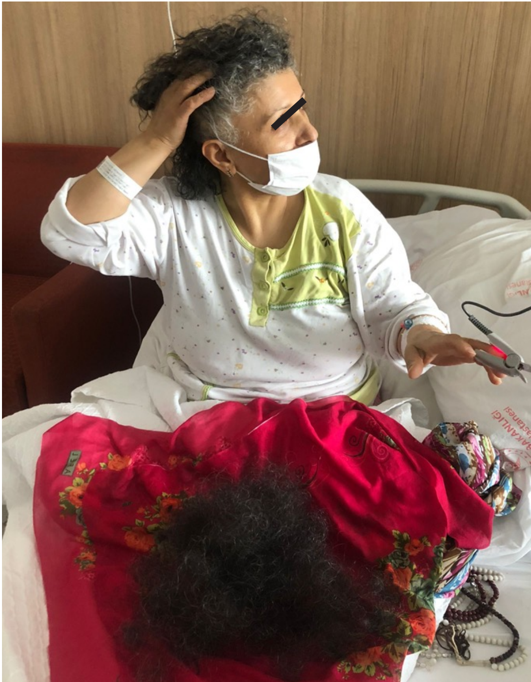
Fig. 4. Inspection of scalp (right side)

HLASCI management. It has also been suggested that COVID-19 and AA exacerbation are related.” 11