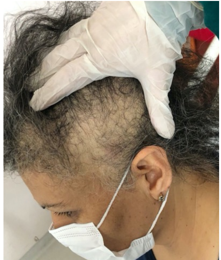
Fig. 3. Inspection of scalp (left side)

As a result, it must be presumed that every patient admitted has come into contact with COVID-19, whether child or adult. 4 According to D'Amico and colleagues' research, between 2% and 50% of patients with COVID-19 have diarrhea. Protein is used by COVID-19, ACE2 (angiotensin-converting enzyme 2), and TMPRSS2 (a serine protease). It is known that ACE2, and the small intestine and the lungs both contain, the epithelium also expresses it. ACE2 is expressed in the upper portions of the oesophagus and the large intestine. 5 Low frequencies of skin conditions were reported in the early studies from COVID-19 patients in Central China. Only 0.2% of the 1099 confirmed cases in Wuhan had cutaneous symptoms. The fight against the most recent outbreaks of the pandemic has increased dermatologist involvement, and interest in the cutaneous symptoms of SARS-CoV-2 infection. 6 An example is the effort to understand "hair loss", and alopecia and COVID-19 tract. Androgens are involved in COVID-19 through a variety of pathways. Cellular coreceptor androgen-regulated TMPRSS2 protease is necessary for SARS-CoV-2 infection, as this enzyme primes the viral spike protein. 7 Given that androgens suppress the immune system, another connection is the androgen-driven immune modulation. Males predominate among adult COVID-19 patients, in