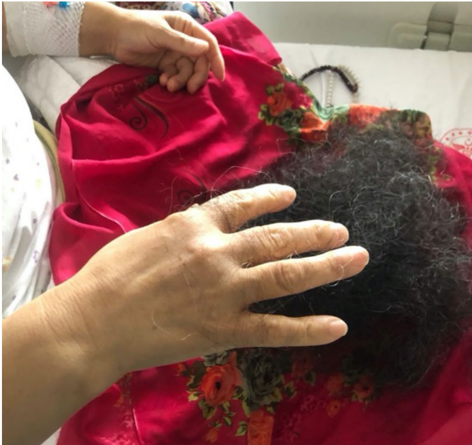
Fig. 1. The amount of hair loss till morning