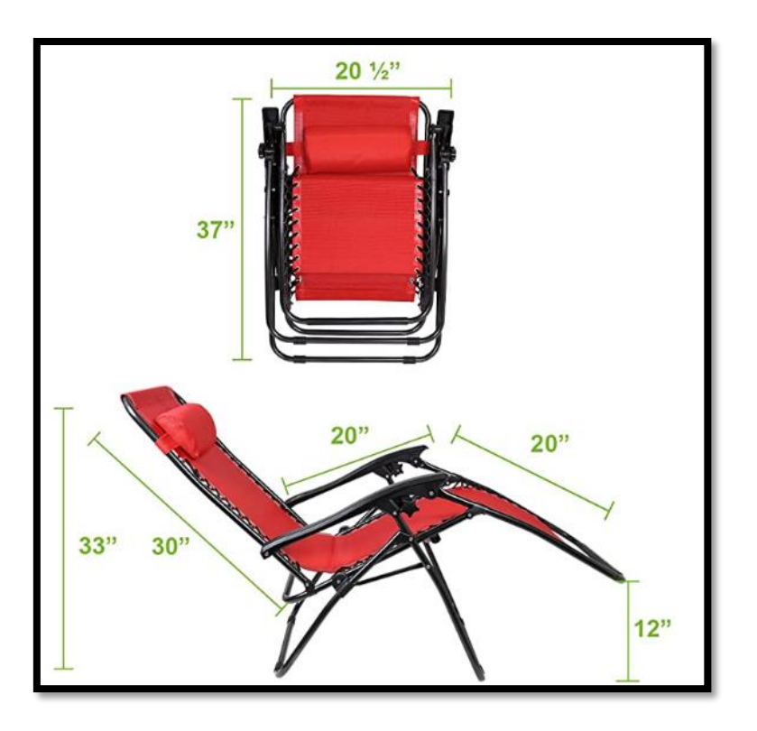
Figure 2. Zero Gravity Chair (ZGC)