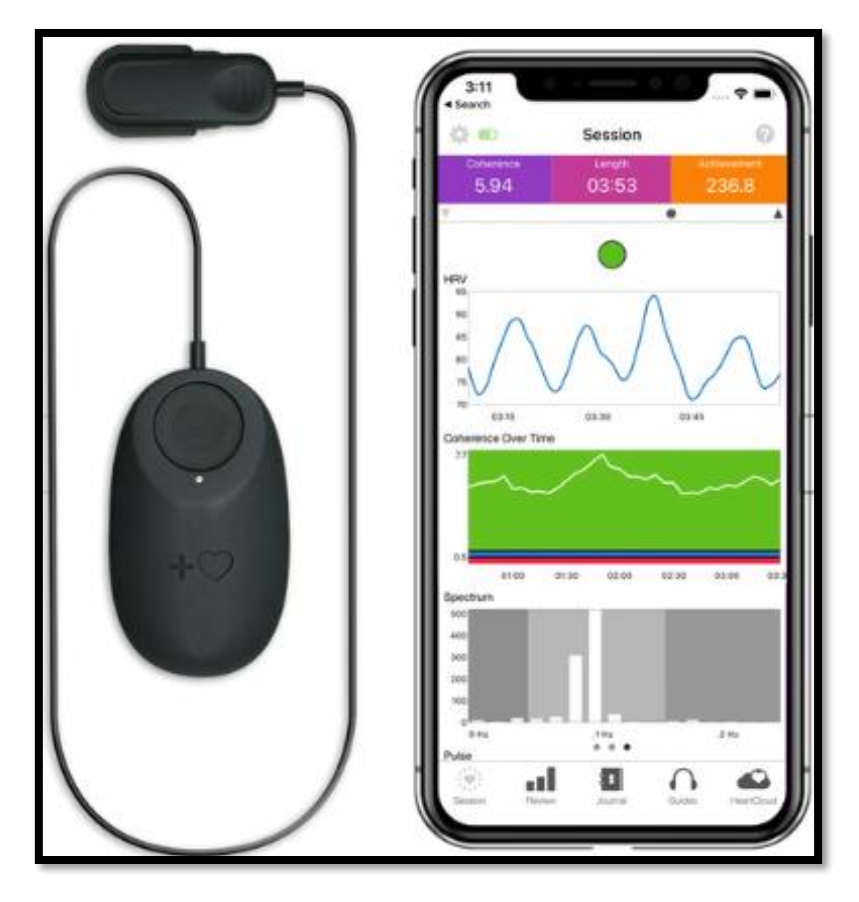
(HeartMath.com) Figure 1. Inner Balance HeartMath Bluetooth and Android Application

Zero Gravity Chair: This foldable and portable special chair does not collect any data, but it allows being in the best body position for HRV measurements. ZGC (zero gravity chair) can be used as a more convenient, comfortable, secure, stable, and safer option to do HRV analysis (Dehghanojamahalleh et. all., 2020).