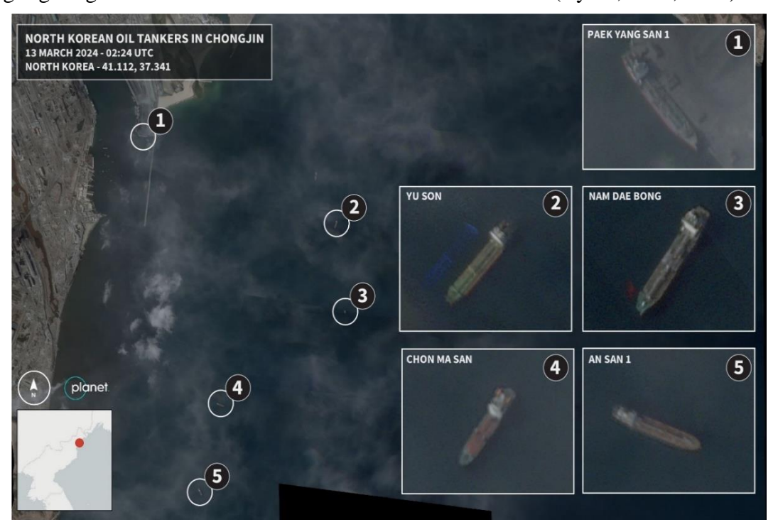
Figure I: North Korean oil tankers in Chongjin (Planet Labs, and RUSI Project Sandstone, Byrne, et al., 2024).

Conversely, South Korea remains the nation's most apprehensive about the armament strategies employed by its northern counterpart. The country is closely monitoring the strengthening ties between Russia and North Korea and the outcomes of their agreements. Official reports indicate that, as of February 2024, North Korea has sent approximately 6,700 containers of ammunition to Russia, believed to include over three million 152-mm artillery shells (Al Jazeera, 2024b). This development is not surprising, given the ongoing Russia-Ukraine War and the sanctions imposed on Russia. The UN Security Council has set North Korea's refined oil imports at 500,000 barrels per year, a clear energy limitation under the international sanctions imposed on North Korea. The ongoing oil trade between the two countries, in defiance of UN Resolution 2397, is a blatant violation of the sanctions and a matter of urgent concern (Chiacu and David Brunnstrom, 2024). RUSI's analysis in March revealed that North Korean tankers were loading oil from a Russian port in the country's Far East, allegedly in exchange for ammunition and missiles, further highlighting the need for stricter enforcement of the sanctions (Byrne, et al., 2024).