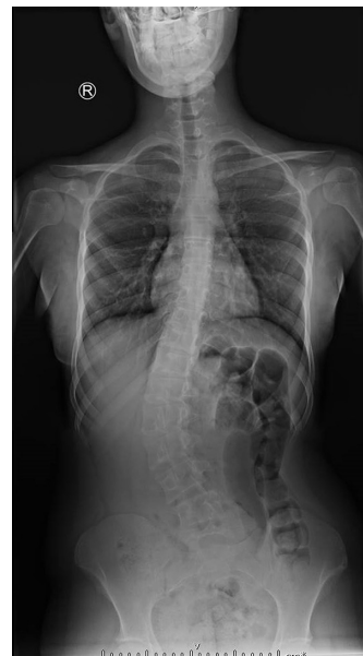
Figure 3. X-ray image example of a scoliosis from the challenging data [27], [28].