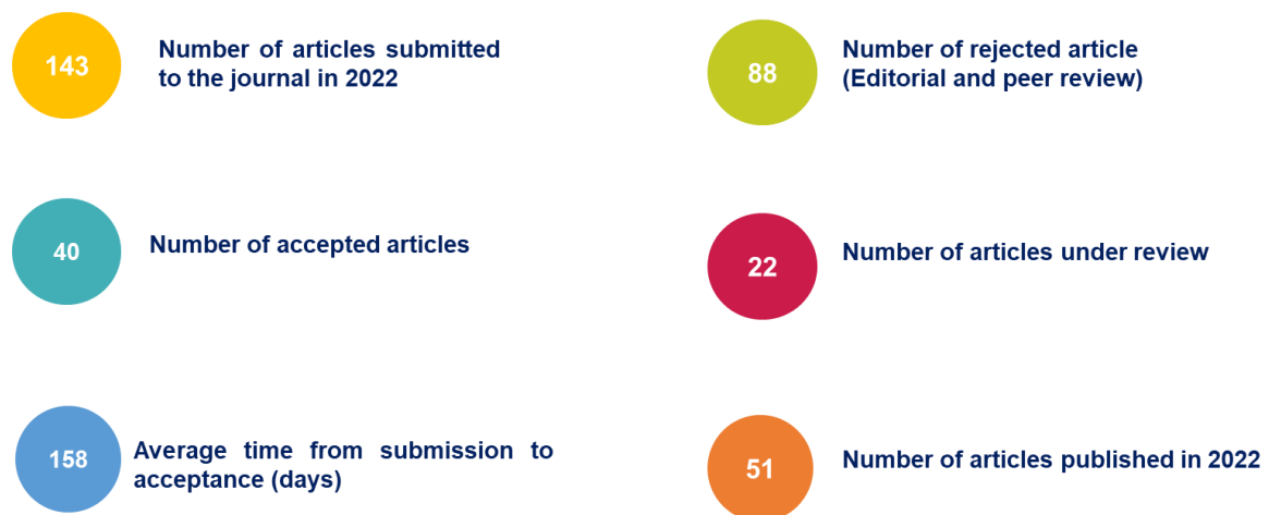
Figure 1. General statistics on regular issues published in 2021

In 2021, 4 regular issues were published by Journal of Productivity . General statistics on the regular numbers published in 2021 are given in Figure 1. Accordingly, a total of 167 articles were sent to the journal in 2021. 114 of these articles were rejected as a result of editorial or peer-review. In this case, the rejection rate of the articles was 68% . In the evaluations made by the editor, the articles were mostly rejected because they were not suitable for the scope of the journal. Another important reason for rejection is that the studies do not have the minimum qualifications to be included in a research article or review article. In the peer-review phase, the articles were rejected because their originality was not sufficient and the methods used in the study were not applied correctly.